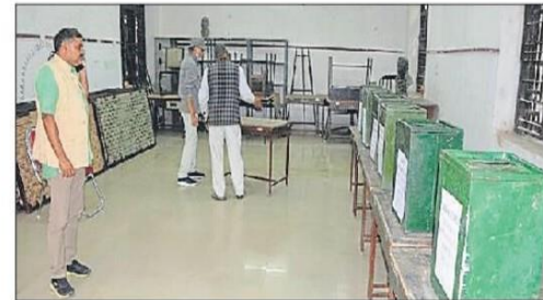
At a polling centre in Patna on Friday.